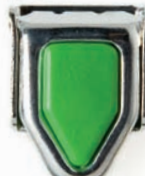
art. 540/16 P