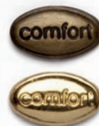
art. 119 comfort