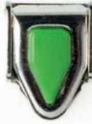
art. 540/14 P