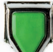
art. 540/20 P